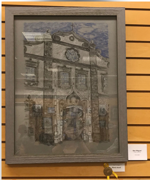
Anne Bell-Merit Award