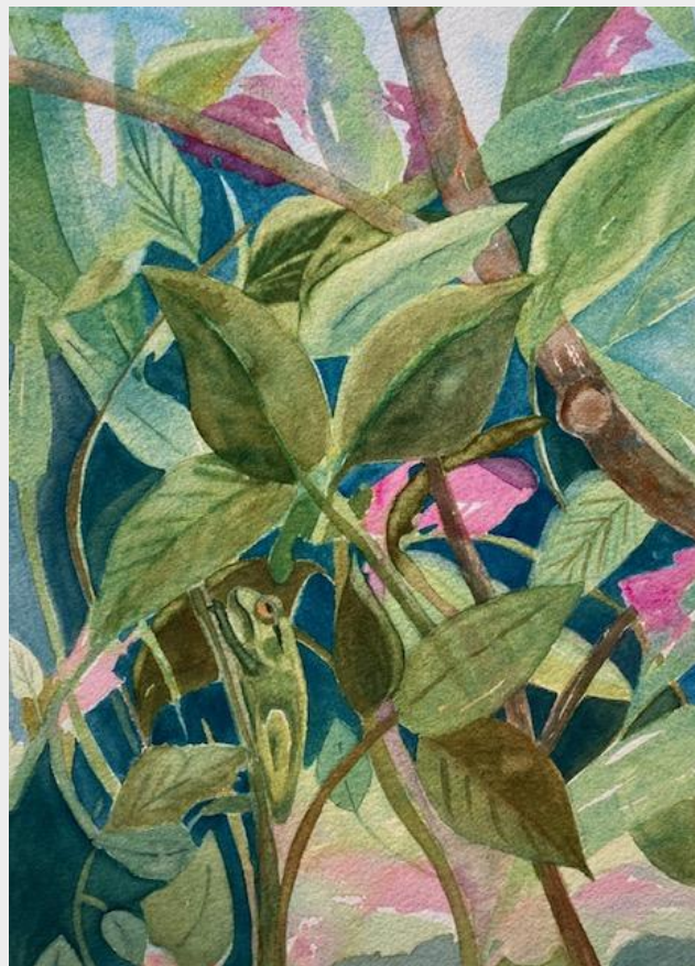
Hidden in Plain Sight

Some samples of Linda's work (both painting and needlepoint)